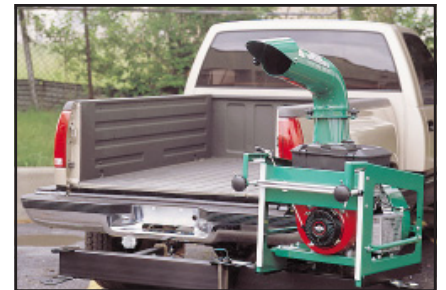
Swing-Away Hitch (Optional) Part # SAH23 For easy dumping and curb-side pickup.

For pricing and availability, contact your authorized Billy Goat Dealer.